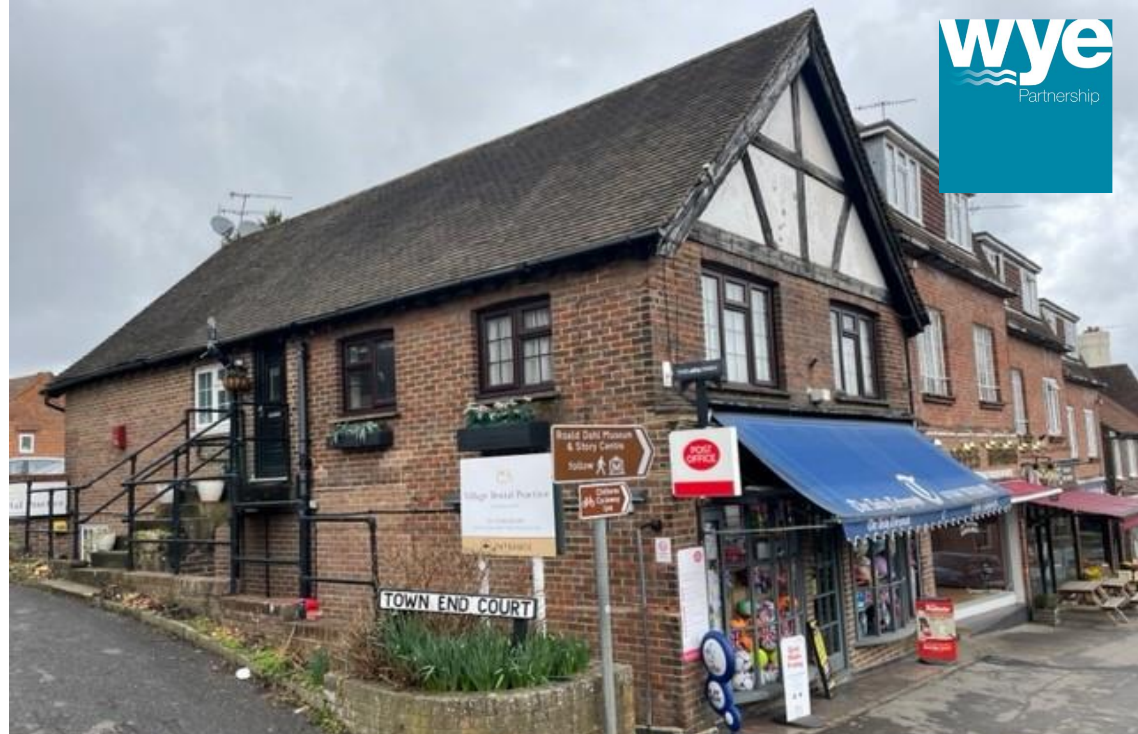
35B Station Approach, Great Missenden, Buckinghamshire, HP16 9AZ